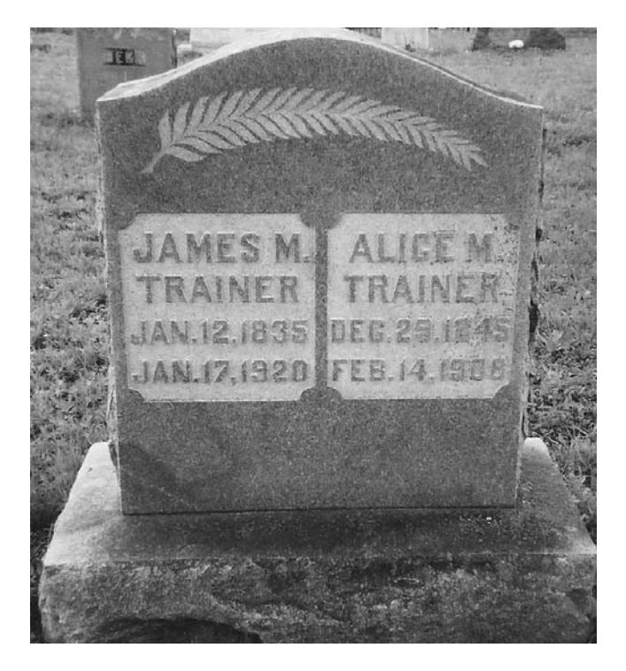
11. The Trainer headstone in Mt. Olive Cemetery, Bexar County, Texas.