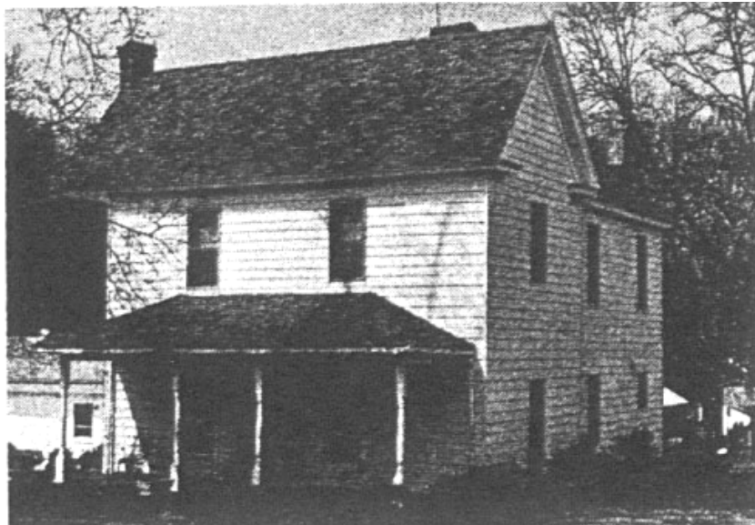
11. The Gritton home located on Chestnut Street in Lorens, South Carolina